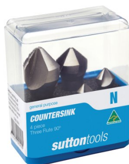
D106 Countersink Sets – 90° Three Flute