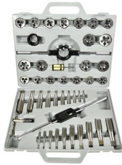
T014 Metric Alloy Steel Tap & Die Set - 45 Piece