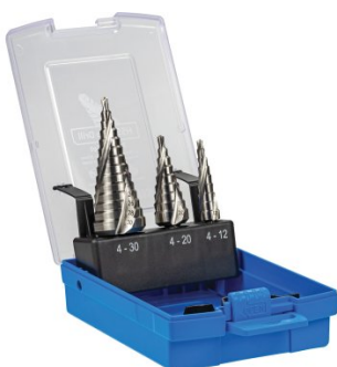
D107 HSS Step Drill Sets