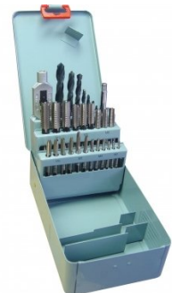
T019 Metric HSS Hand Tap & Drill Set - 29 Piece