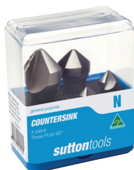
D106 Countersink Sets – 90° Three Flute