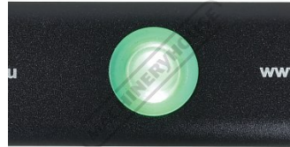
Power Light Indicator