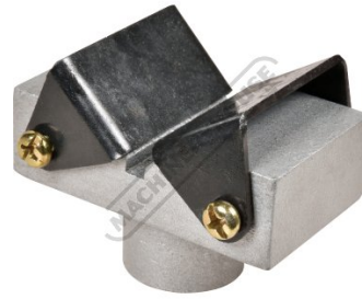
Included Larger Clamp Attachment