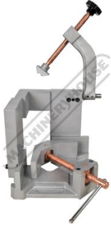
Shown with Top Clamp in Upright Position