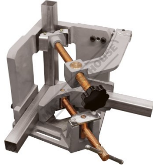
Shown With Box Tubing