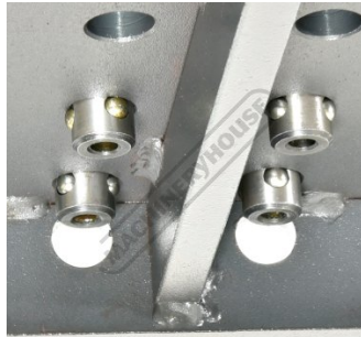
Bottom View on Welding Table