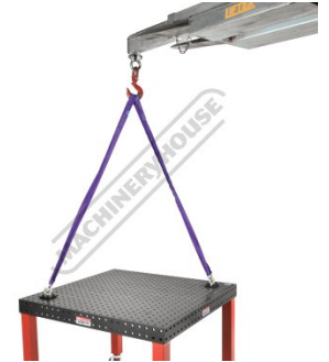
Shown Using Optional Lifting Kit