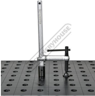
250mm Clamp Height