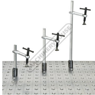
Optional Range Available