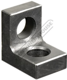
Angle Bracket 40x40x30mm