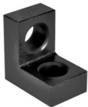
W08320 Right Angle Bracket / Stop