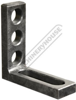
Angle Bracket 90x90x30mm