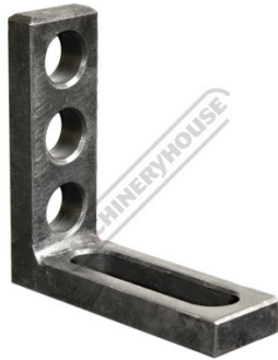
Angle Bracket 90x90x30mm