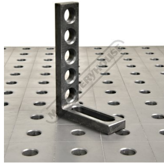
Shown on Welding Table