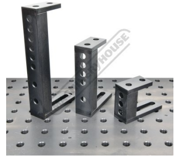
100mm 200mm 300mm Range Available