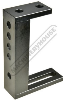
Clamping Square 200mm