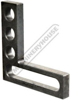
L Bracket 105x105x12mm