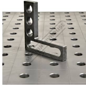
Shown on Welding Table