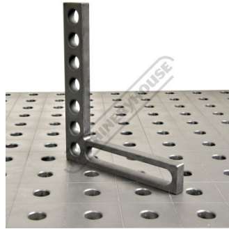
Shown on Welding Table