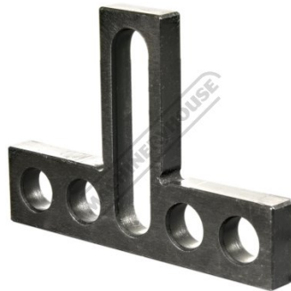
T Bracket 130 x 90 x 30mm