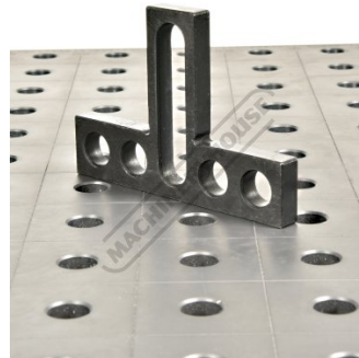
Shown on Welding Table