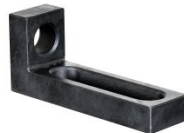
W08321 Right Angle Bracket / Stop