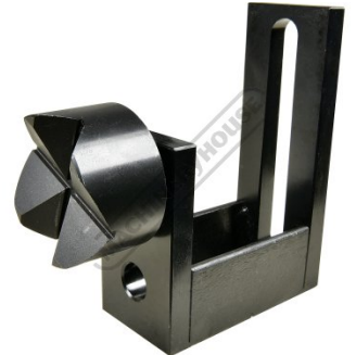
Shown Setup on Optional Riser