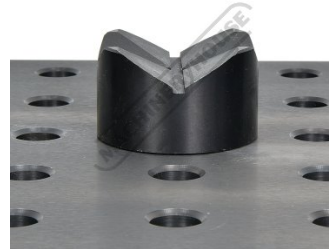
Shown on Welding Table