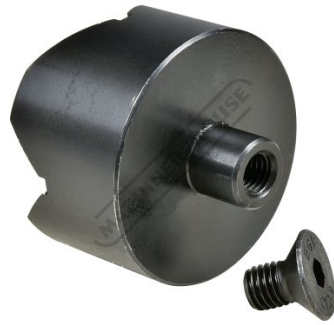
16mm Diameter Shank