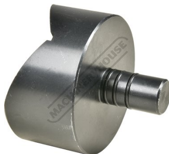
16mm Diameter Shank