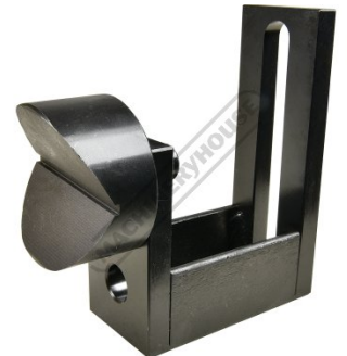
Shown Setup with Optional Riser