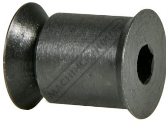
Countersink Lock Pin 16x24mm