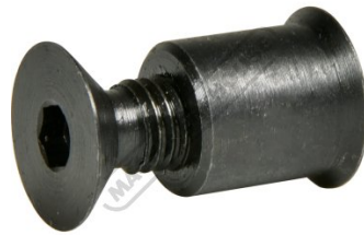
Hex Key Lock