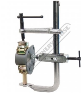
Shown Mounted to Clamp