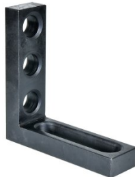
W08324 Right Angle Bracket / Stop