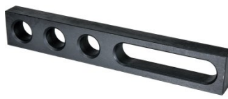
W08343 Straight Bar Stop