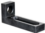
W08321 Right Angle Bracket / Stop