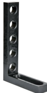
W08325 Right Angle Bracket / Stop