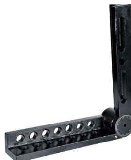
W08329 Adjustable Angle Bracket