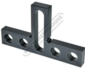
250x150x25mm T Brackets