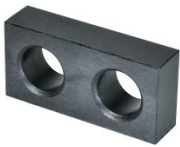
W08340 Straight Bar Stop