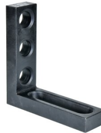
W08324 Right Angle Bracket / Stop