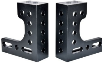
W08326 Angle Bracket Set