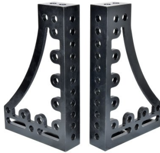
W08327 Angle Bracket Set