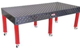
W08260 3000 x 1500mm M28 Pro Series Welding Table