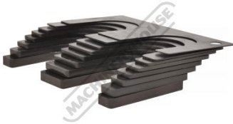
Shim Thickness Comparison