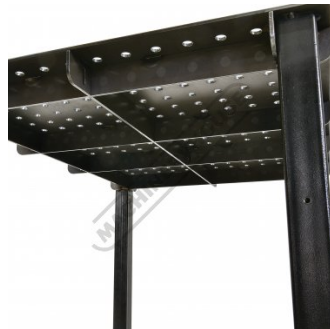
Rib Design for Strength