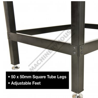
• 50 x 50mm Square Tube Legs • Adjustable Feet