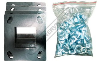
Includes Base Plate Kit for Optional Castor Wheels