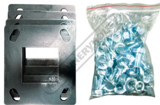
Includes Base Plate Kit for Optional Castor Wheels