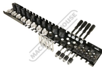
Shown on Optional Tool Tray (W08524)