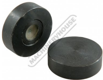
8 x Magnetic Rest