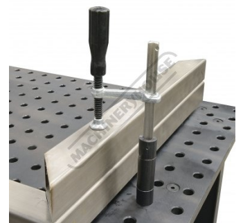
Shown Screwed into Threaded Riser with Optional Adaptor