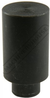
4 x Insert Stop