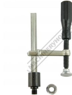
4 x Clamp