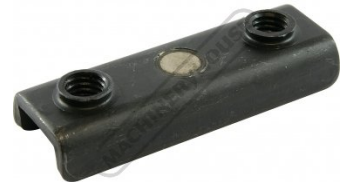
4 x Threaded Magnetic Adaptor