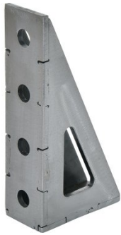
W08532 Welding Table Square