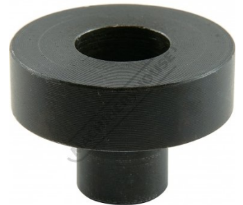
4 x V Spacer