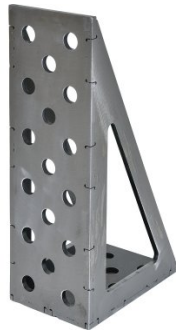
W08554 Welding Table Square