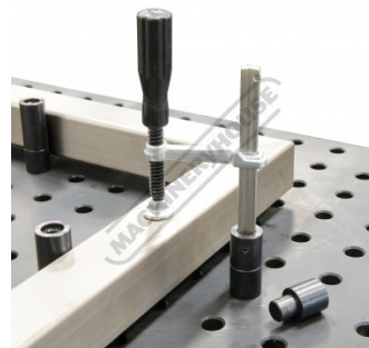
Shown Screwed into Optional Adaptor View2