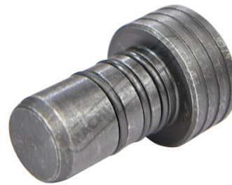
3 x O Rings