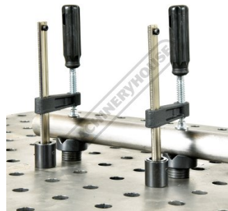
Clamps Shown Clamping Round Tube