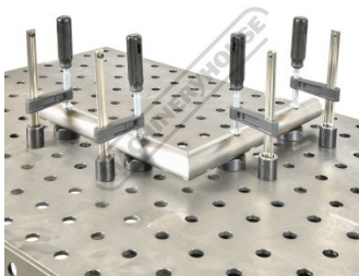
Round Tube Setup with Extra 2 Clamps and V Pads