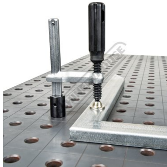
Shown Clamping Rectangular Tube