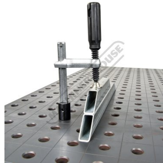
Shown Clamping 2 Pieces of Rectangular Tube