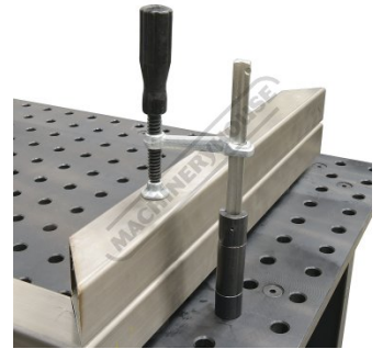
Optional Threaded Riser & Adaptor (W08513 & W08515)