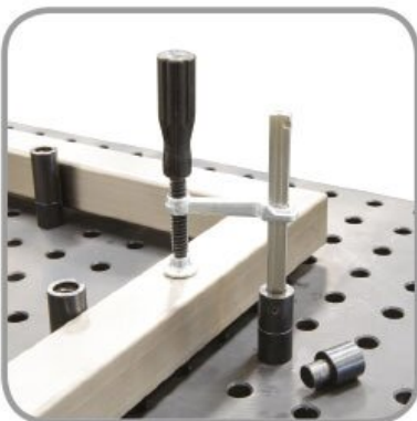
Optional SC-60 Clamps (W08510) screw directly into adaptors for quick position clamping.