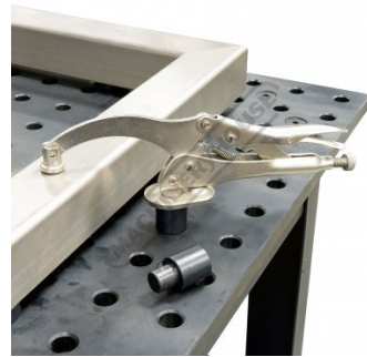
Optional Clamp C103 shown screwed into Threaded Riser