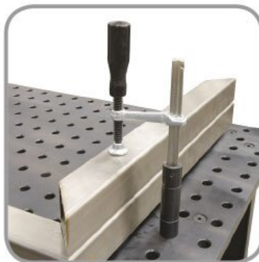
Optional SC-60 Clamps (W08510) & Risers (W08515) screw directly into adaptors for increased clamp height.