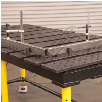
The Stops Provide Low Profile Locating and Make Workpiece Removal Easy