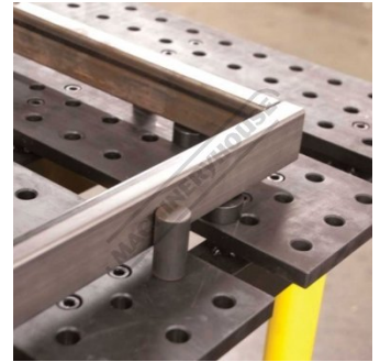
Quick Effective Locating and Positioning of Stock