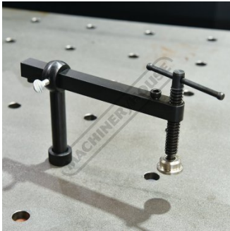
Shown on Welding Table