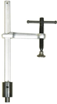
W07832 Welding Table Clamp