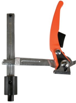
W07834 Ratchet Welding Table Clamp