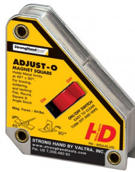
W1006 Adjust-O Magnet Square - Heavy Duty