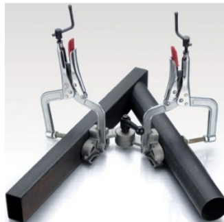
W1012 Adjustable Corner Clamping Plier Set