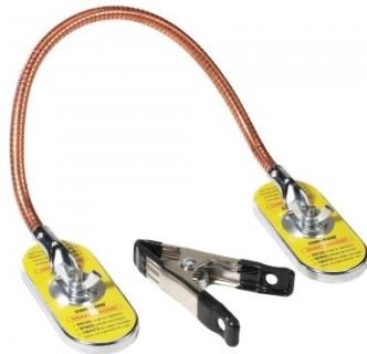
W1005 Snake Magnet & Spring Clamp