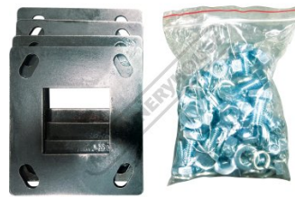
Wheel Bracket Kit