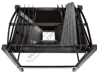
Pull Out Disposable Ribs