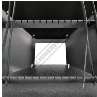
Dust Waste Chute