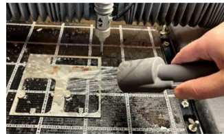
Wazer Pro Water Nozzle