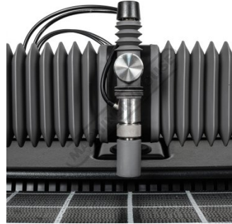
Cutting Head Inside Front View