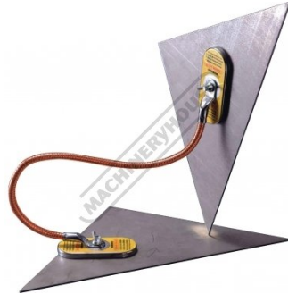
Shown In Use 2