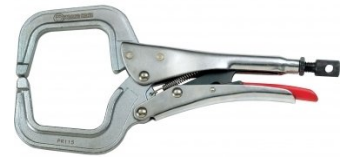
W1016 Locking C-Clamp - Round Tip