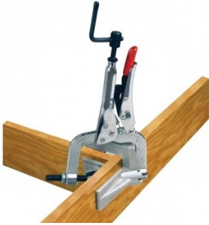
W1013 Corner Clamping Plier