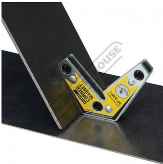
Shown In Use 4