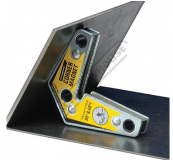
Shown In Use 3