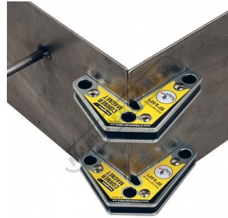
Shown In Use 2