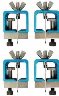
W113 Butt Welding Aluminium & Steel Clamp Set