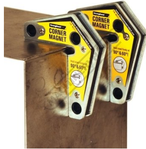
Shown In Use 1