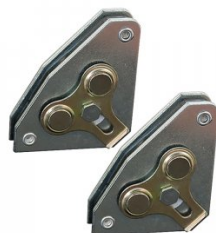
W1011 XYZ Magnet Squares - Multi-Angle - (2-Pack)