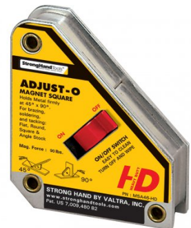
W1007 Adjust-O Magnet Square - Heavy Duty