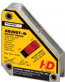
W1006 Adjust-O Magnet Square - Heavy Duty