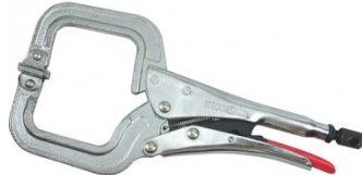
W1017 Locking C-Clamp - Swivel Tip