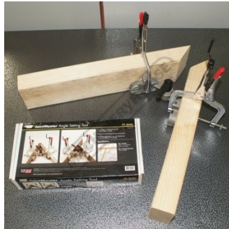
Shown Clamping Wood Swiveling Open