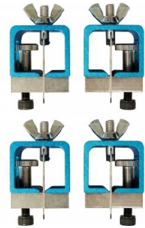
W113 Butt Welding Aluminium & Steel Clamp Set