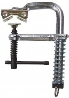
W07971 BuildPro Magspring Clamp