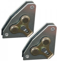
W1011 XYZ Magnet Squares - Multi-Angle - (2-Pack)