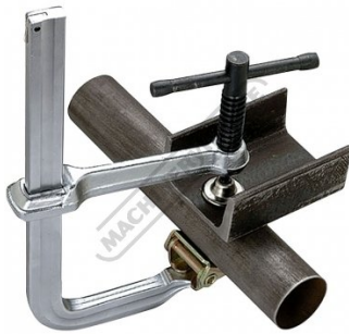
Clamping Steel Pipe