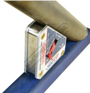
Shown Clamping Round Tube