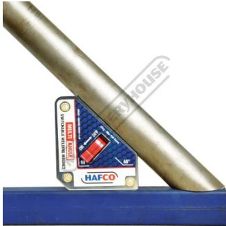
Shown Set Up in 45 Degrees