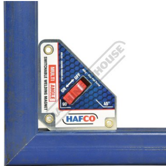
Shown Set Up in 90 Degrees