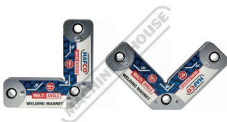
Multi Angle Magnets