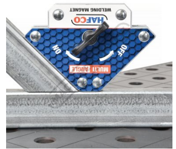
135 Degree Angle