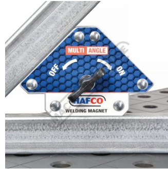
45 Degree Angle