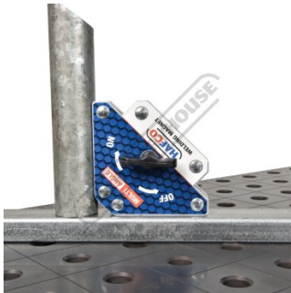
Round Pipe Compatibility