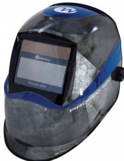
W001 Auto Darken Welding Helmet - 9~13 Shade