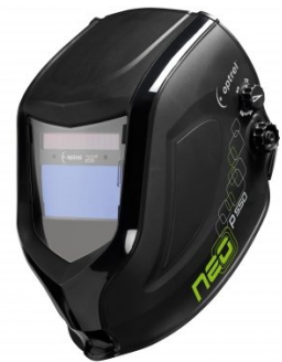
W1090 Auto Darken Welding Helmet - 9 ~ 13 Shade