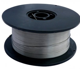
W1140G Ø0.8mm Gasless Mild Steel MIG Welding Wire