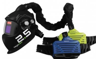
W1092 Auto Darken Welding Helmet with PAPR Respiratory System - (2.5) 8 ~ 12 Shade