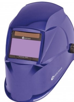
W002 Auto Darken Welding Helmet - 9~13 Shade