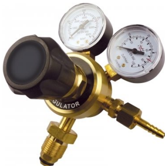
W1140D Argon Gas Regulator-Twin Gauge