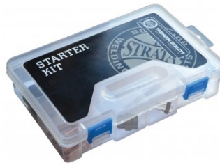
W1105P Consumable Mig Welder Starter Pack