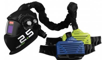
W1092 Auto Darken Welding Helmet with PAPR Respiratory System - (2.5) 8 ~ 12 Shade