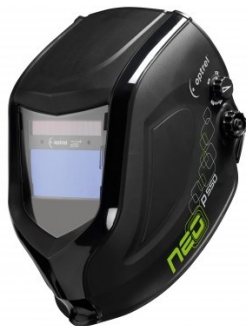
W1090 Auto Darken Welding Helmet - 9 ~ 13 Shade