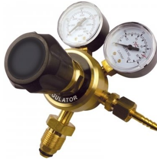
W1140D Argon Gas Regulator-Twin Gauge