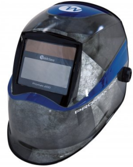
W001 Auto Darken Welding Helmet - 9~13 Shade