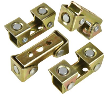
W1091 Magnetic Swivel V-Pad Clamps