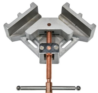
V099 90 degree Angle Vice Clamp