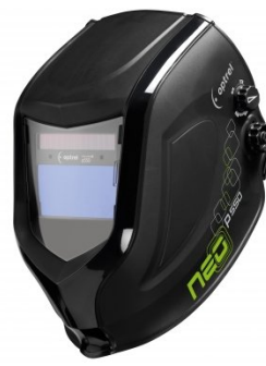
W1090 Auto Darken Welding Helmet - 9 ~ 13 Shade