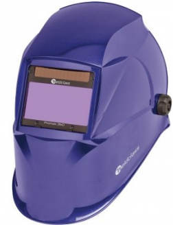
W002 Auto Darken Welding Helmet - 9~13 Shade