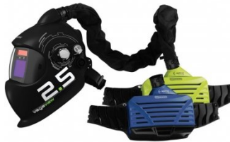
W1092 Auto Darken Welding Helmet with PAPR Respiratory System - (2.5) 8 ~ 12 Shade