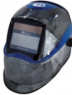
W001 Auto Darken Welding Helmet - 9~13 Shade