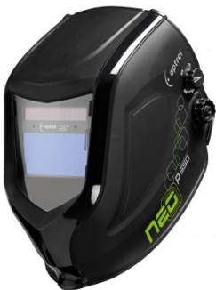
W1090 Auto Darken Welding Helmet - 9 ~ 13 Shade