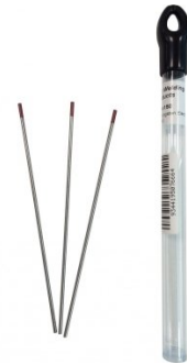
W1142V 2.4m Tig Tungsten Electrode - Thoriated Red