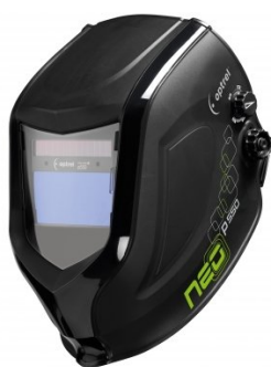
W1090 Auto Darken Welding Helmet - 9 ~ 13 Shade