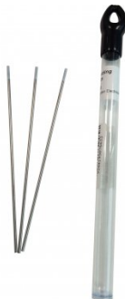
W1142Y 2.4mm Tig Tungsten Electrode - Zirconiated White