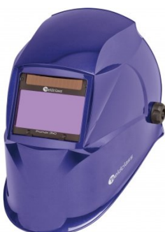
W002 Auto Darken Welding Helmet - 9-13 Shade