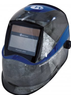
W001 Auto Darken Welding Helmet - 9~13 Shade