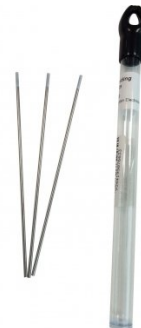
W1142Z 3.2mm Tig Tungsten Electrode - Zirconiated White