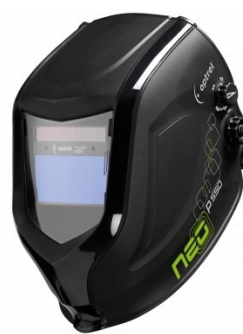
W1090 Auto Darken Welding Helmet - 9 ~ 13 Shade