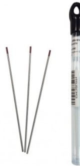
W1142U 1.6mm Tig Tungsten Electrode - Thoriated Red