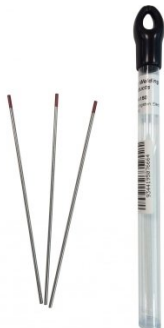
W1142V 2.4m Tig Tungsten Electrode - Thoriated Red